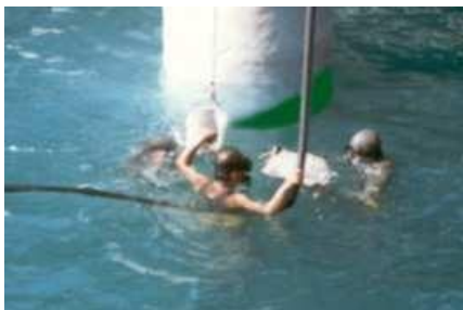
Spreading of SUBCOM T.260

The whole Contract for the anti-corrosive protection of some 11.290 sq.m. with about 93.000 kgs. of SUBCOM T.260 was completed in less than 400 calendar days, including holidays and weather stand-by.