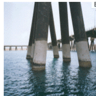
General view of the Jetty